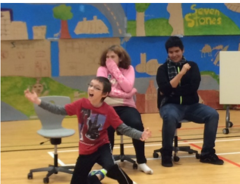
Globe Theatre and PLC 3 collaboration project.