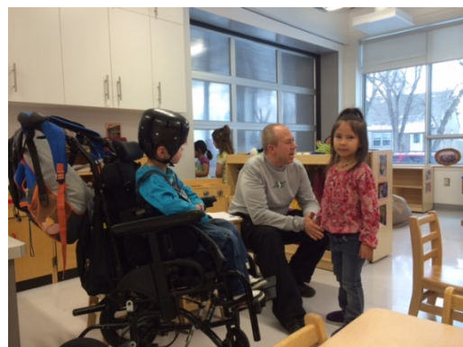
Pre K and EDC integration

When cards are purchased, a notice will go home with your child when they have only 2 remaining lunches left. This will allow another card to be purchased with a day in advance of the student needing lunch.